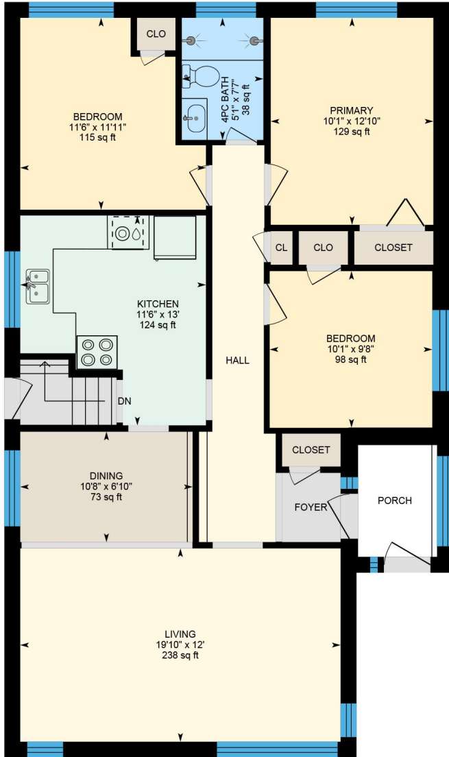
Main Floor Exterior Area 1178.12 sq ft

Main Building: Total Exterior Area Above Grade 1178.12 sq ft