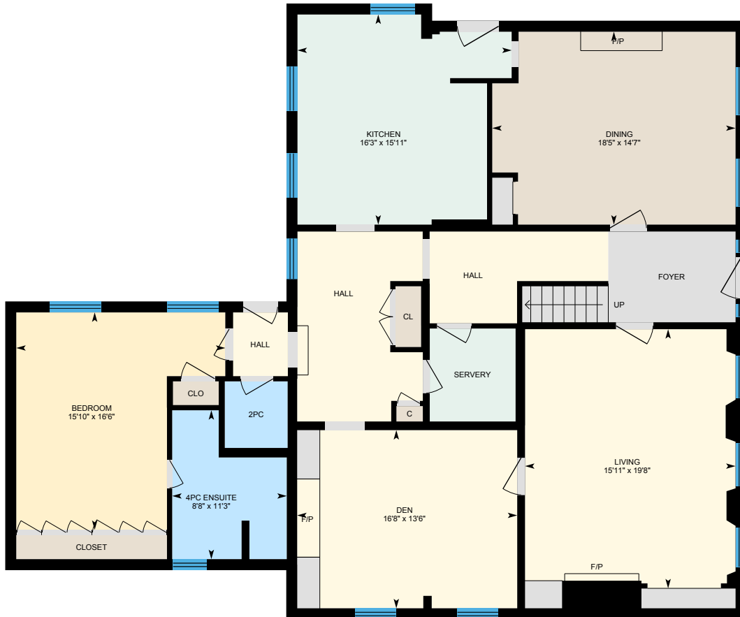
Main Floor Exterior Area 2028 sq ft

Main Building: Total Exterior Area Above Grade 3621 sq ft